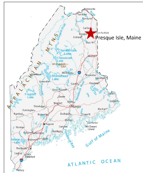
Figure 1. The City of Presque Isle is in rural northeastern Maine on U.S. Route 1.

The catalyst for the Project is a related US 1 bypass project which will reroute heavy freight traffic around the city. The Presque Isle Freight and Mobility Priority Corridor Project —awarded an FY22 INFRA grant—will create a roadway for trucks to travel around the city, allowing safer and less congested conditions in downtown Presque Isle. This will reduce the need for significant ongoing maintenance necessary due to heavy